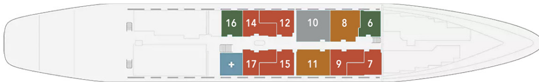
MISTRAL DECK Infirmary, staterooms 6-16