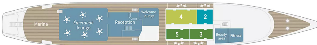
ALIZÉS DECK Marina, lounge, reception and welcome lounge, beauty and fitness areas, staterooms 2-5