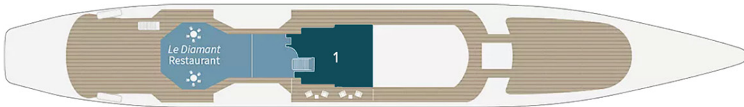
ZÉPHYR DECK Panoramic restaurant, bridge, and Owner Suite (stateroom 1)