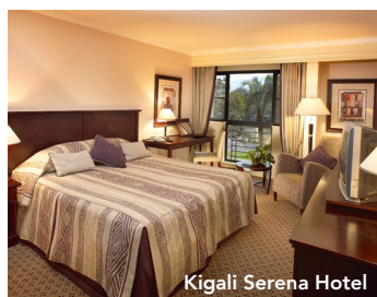
Kigali Serena Hotel

Activity Level: Guests should be in very good physical condition with the ability to walk up and down hills in tropical forests on uneven, sometimes rocky, steep and/or slippery, terrain. The forest can be humid and paths may have heavy vegetation.