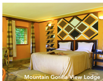
Mountain Gorilla View Lodge