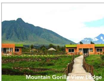
Mountain Gorilla View Lodge