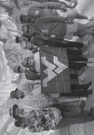
West Virginia University alumni on Orbridge's Death Valley, Yosemite and the Great Parks of California 2022 travel program.

Special Alumni Rate: Save more than $1,000 per couple