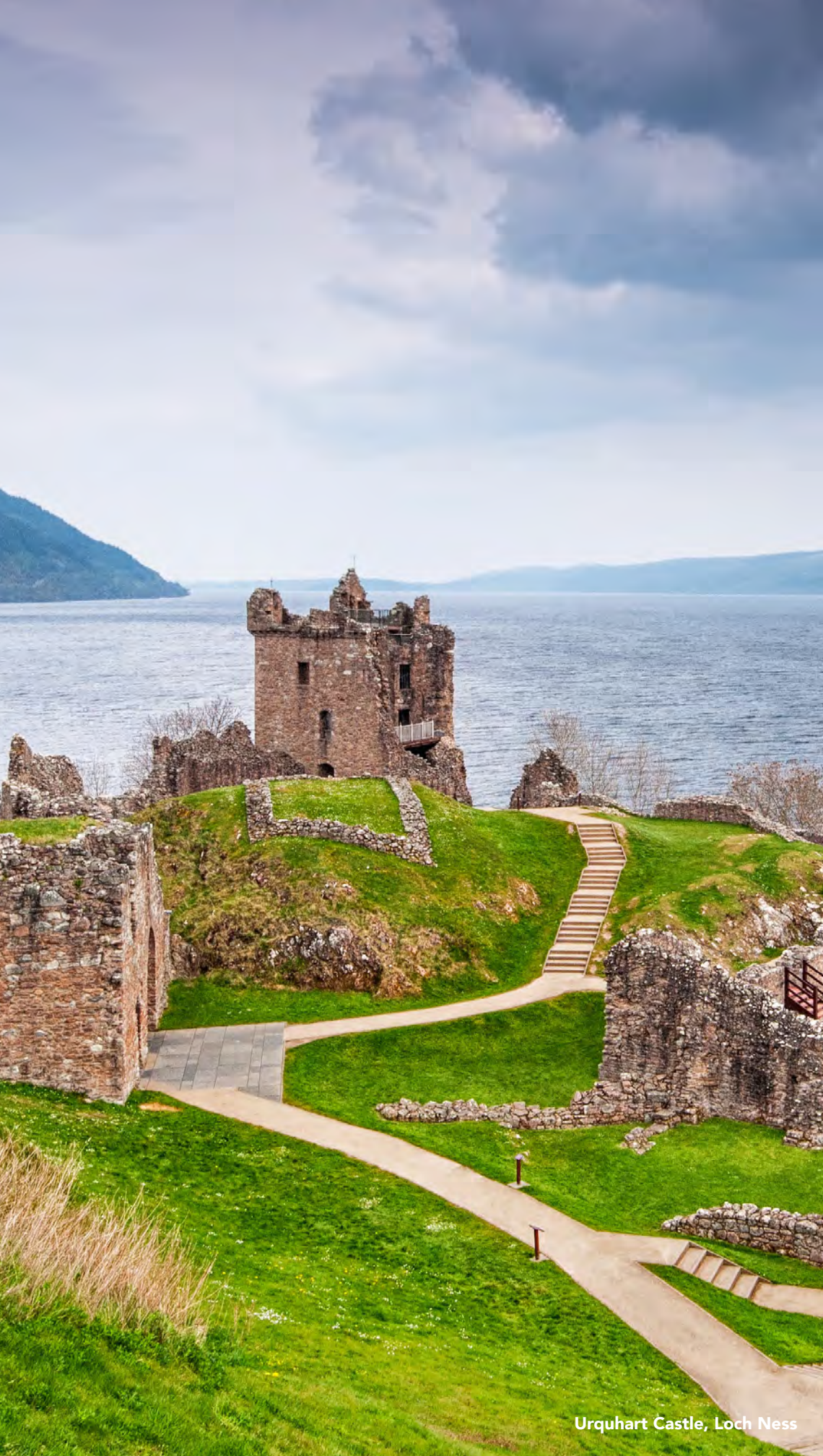
Urquhart Castle, Loch Ness