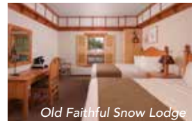
Old Faithful Snow Lodge