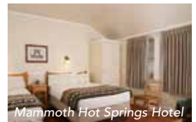
Mammoth Hot Springs Hotel