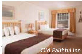
Old Faithful Inn

Confirmed by the National Park Service, you'll stay at one of the following Yellowstone properties: Old Faithful Inn, Old Faithful Snow Lodge, Canyon Lodge & Cabins or Mammoth Hot Springs Hotel. Each offers comfortable lodging and modern amenities.