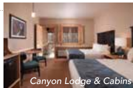
Canyon Lodge & Cabins