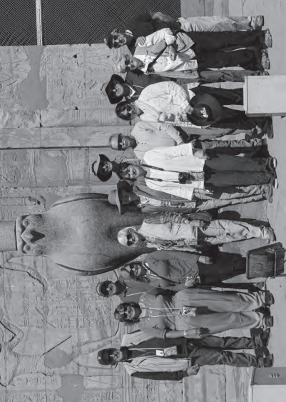
NC State alumni on Orbridge's Discover Egypt & the Nile Valley 2019 travel program.