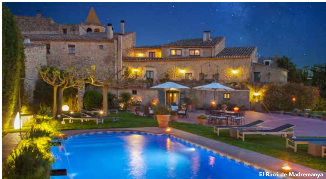
El Racó de Madremanya