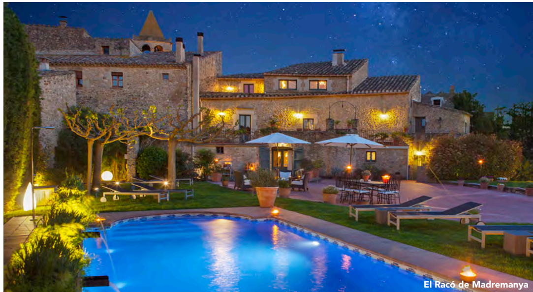
El Racó de Madremanya