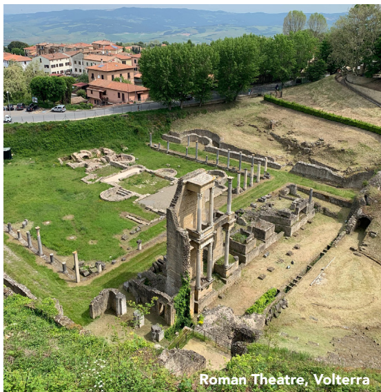
Roman Theatre, Volterra