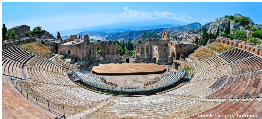
Greek Theatre, Taormina

Activity Level: Guests should be able to enjoy two hours or more of walking, be sure-footed on cobbled surfaces, and walk up and down hillsides and stairs without assistance.