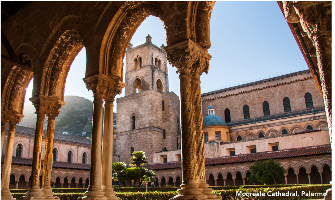
Monreale Cathedral, Palermo