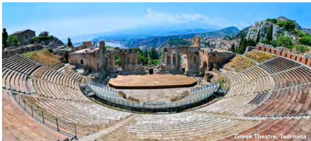
Greek Theatre, Taormina

Activity Level: Guests should be able to enjoy two hours or more of walking, be sure-footed on cobbled surfaces, and walk up and down hillsides and stairs without assistance.