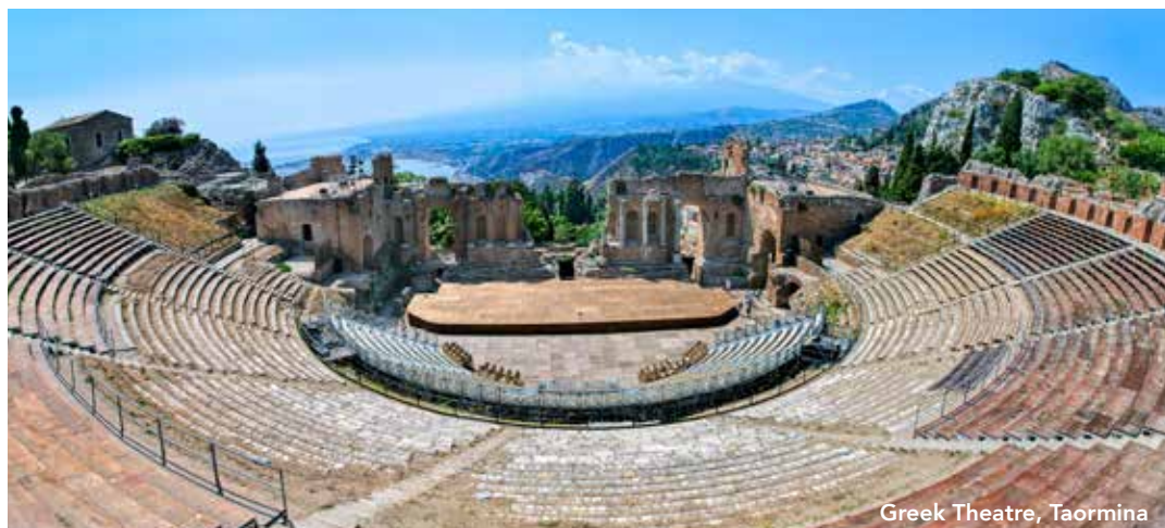
Greek Theatre, Taormina

Activity Level: Guests should be able to enjoy two hours or more of walking, be sure-footed on cobbled surfaces, and walk up and down hillsides and stairs without assistance.