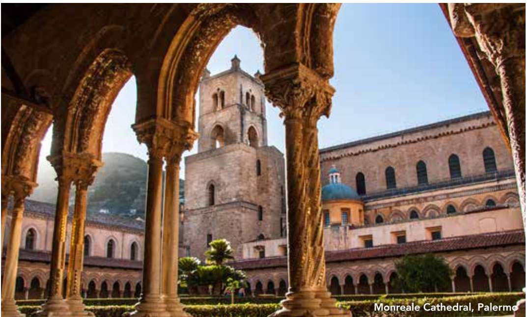
Monreale Cathedral, Palermo