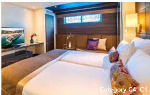
Category C4, C1

Individual climate control, walk-out exterior balcony, choice of bed configuration (double or twin bed), walk-in wardrobe, comfortable corner sofa, flat screen television, direct dial telephone, safe, and luxurious en suite bathroom with shower, bathrobes, and hair dryer. 284 sq. ft.