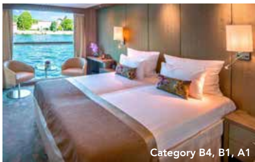
Category B4, B1, A1