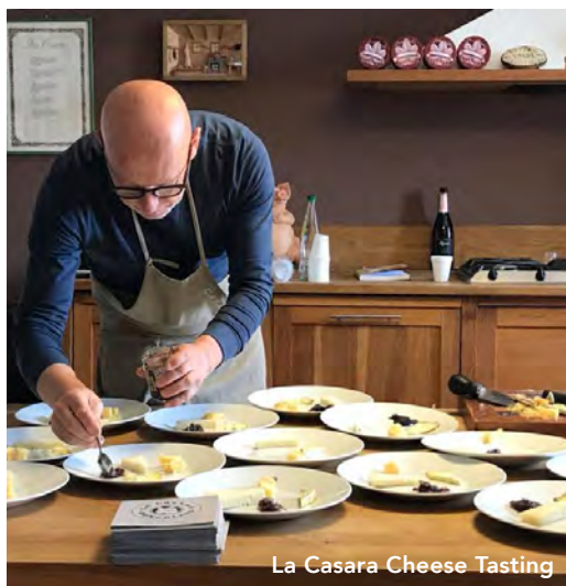
La Casara Cheese Tasting