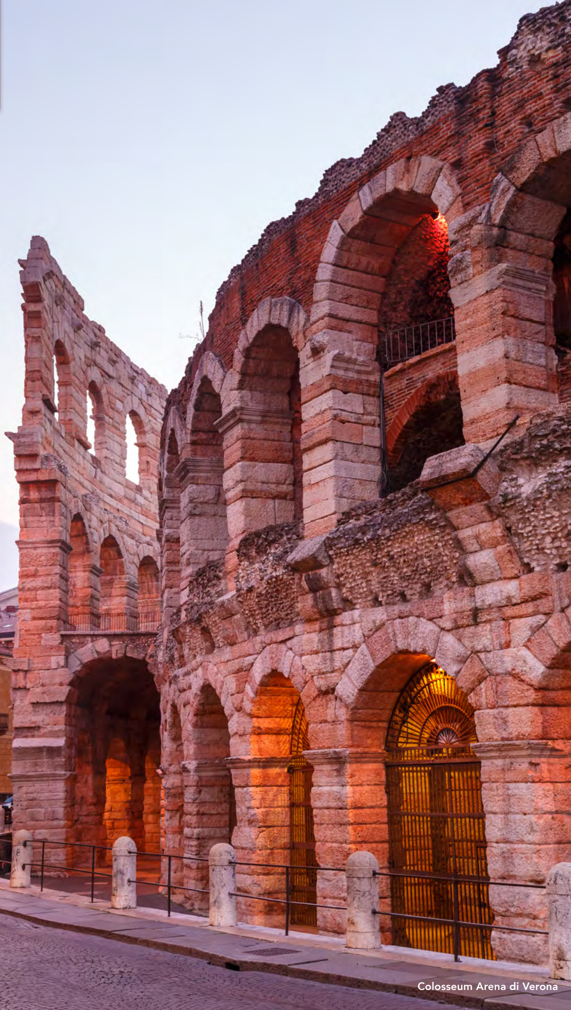
Colosseum Arena di Verona