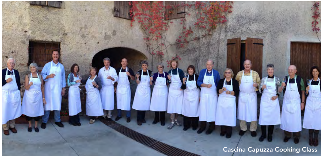
Cascina Capuzza Cooking Class