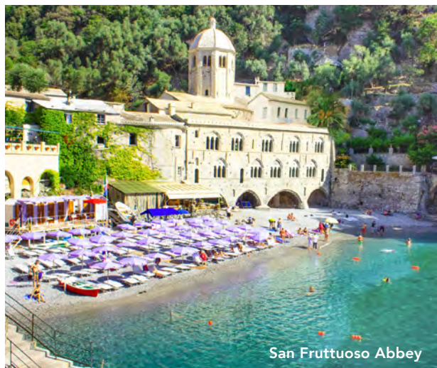
San Fruttuoso Abbey