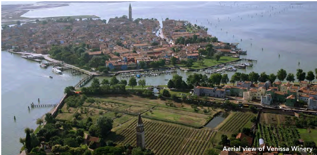
Aerial view of Venissa Winery