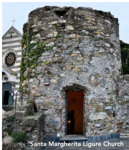
Santa Margherita Ligure Church