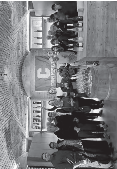
Cornell alumni on Orbridge's Flavors of Northern Italy 2022 travel program.

Special Alumni Rate: Save more than $1,000 per couple