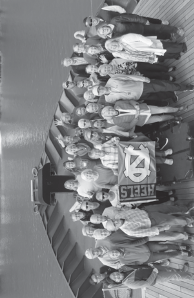
Tar Heels on Obridge's Discover Southeast Alaska by Small Ship 2021 travel program.

Special Alumni Rate: Save more than $1,000 per couple