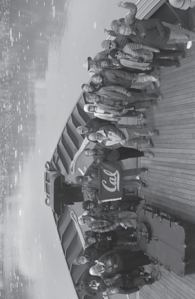
Cal Discoveries Travelers on Orbridge's Discover Southeast Alaska by Small Ship 2022 travel program.

Special Alumni Rate: Save more than $1,000 per couple