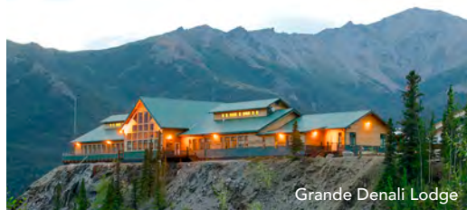
Grande Denali Lodge