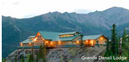
Grande Denali Lodge