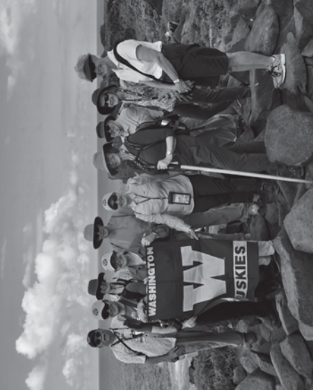
UW alumni on Orbridge's The Galapagos Islands 2020 travel program.