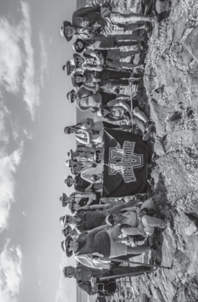
Vanderbilt alumni on Orbridge's The Galapagos Islands 2019 travel program.

to receive the FREE Orbridge Expedition Library we've assembled for this program.**