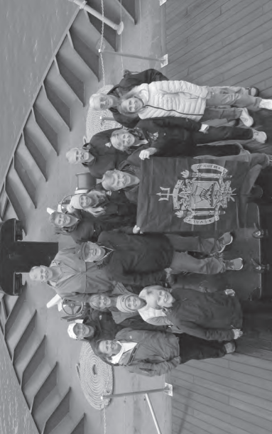
USNA alumni on Orbridge's Discover Southeast Alaska by Small Ship 2021 travel program.

Special Alumni Rate: Save more than $1,000 per couple